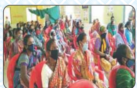
DISHA Kendra Karjat , Block JANSAMVAD at Kadav Primary Health Care Center on 26/3/2021